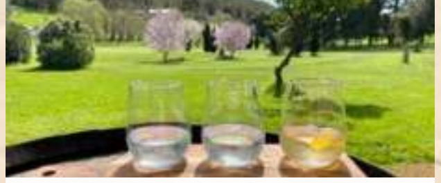
Perth Hills Wine, Gin and Cider Tours Saturday 4 November