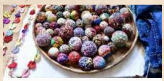
Armadale Hills Arts Trail 10 - 19 November, Fridays - Sundays