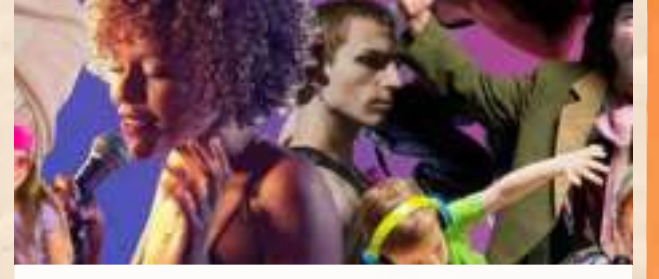
Performance Synergy Festival Wednesday 4 October - Sunday 8 October